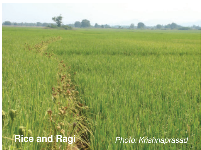
Rice and Ragi