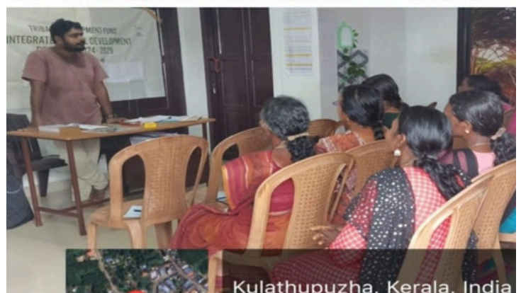
Kulathupuzha, Kerala, India