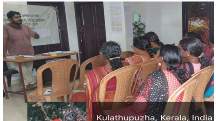
Kulathupuzha, Kerala, India